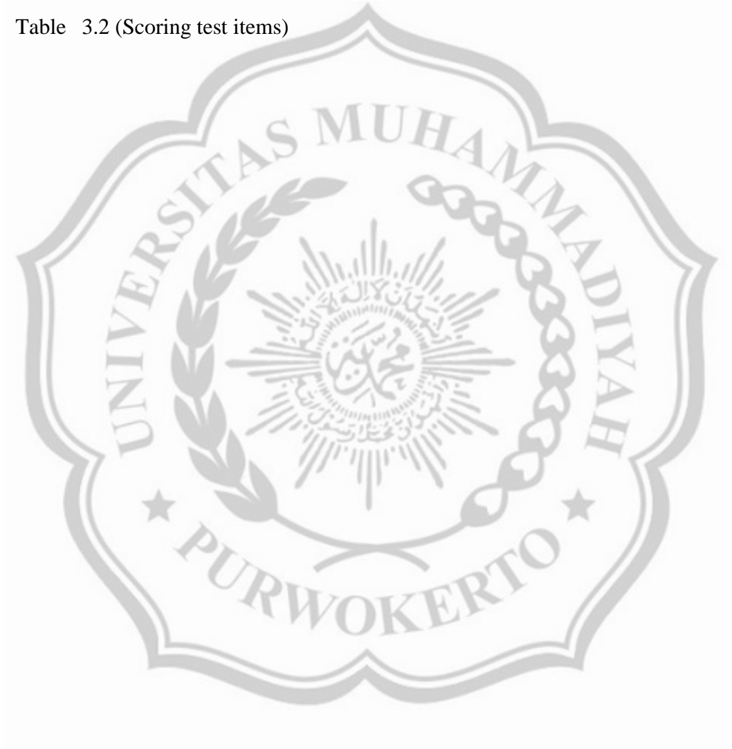
Table 3.2 (Scoring test items)