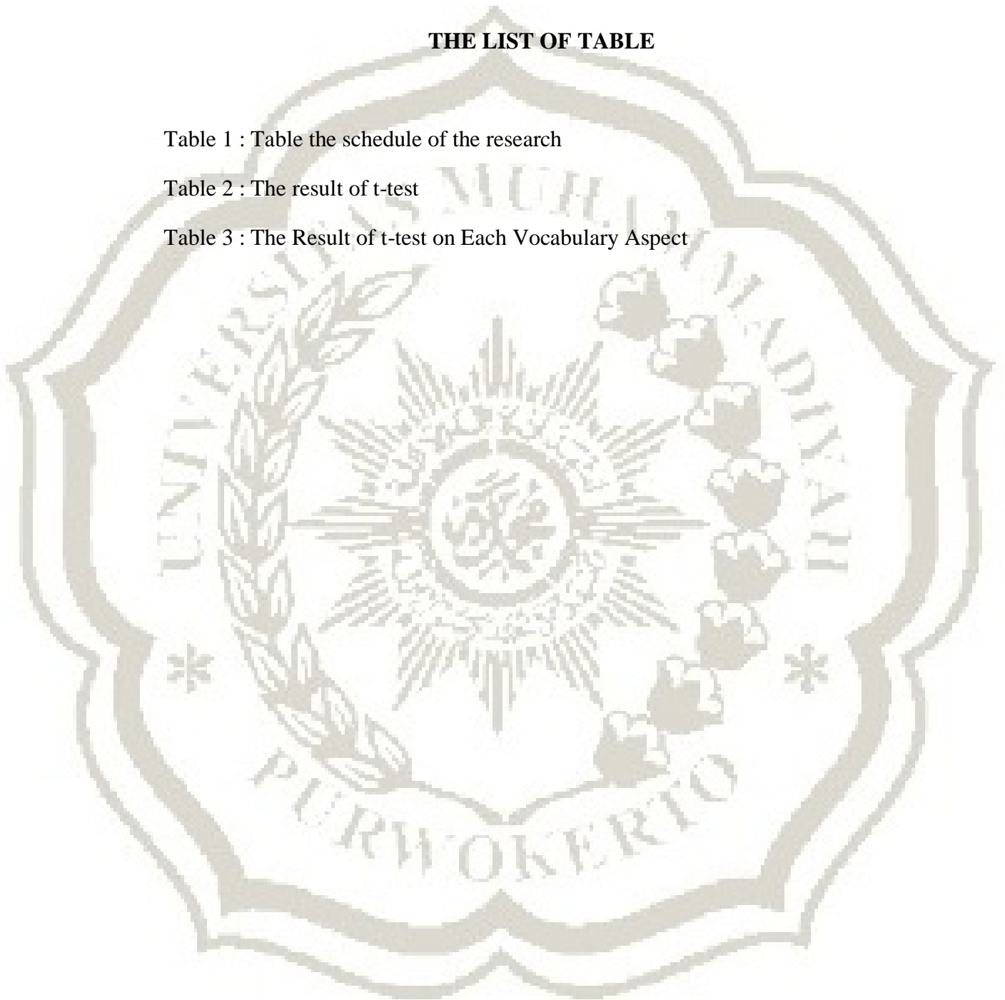
Table 3 : The Result of t-test on Each Vocabulary Aspect