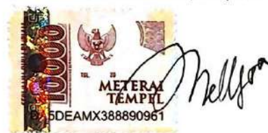
Mellysa Dwi Rossita