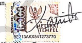
Hamratuz Zahra Kamilatuz Z