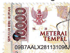
Isnaeni Dewi Zaherli

Dibuat di : Purwokerto Pada tanggal : 16 Agustus 2024 Yang menyatakan,