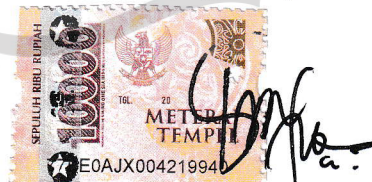
Syifa Aulia Nurul Nastitie