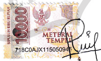
Roofi Kusuma Dewi

Dibuat di : Purwokerto Pada tanggal : 4 September 2023 Yang menyatakan,