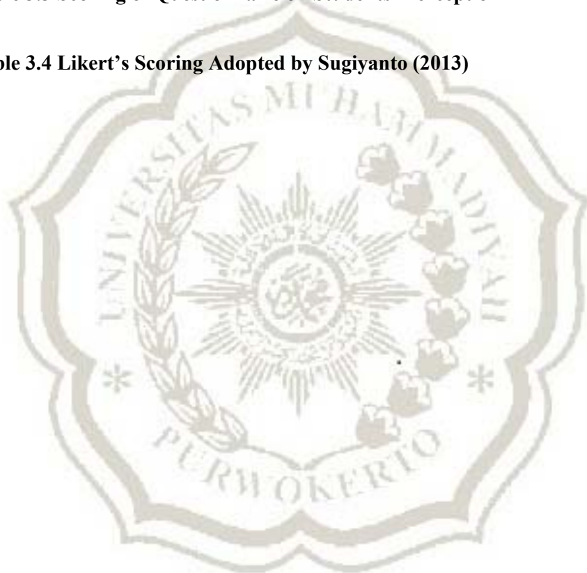
Table 3.4 Likert's Scoring Adopted by Sugiyanto (2013)

Table 3.3 Scoring of Questionnaire on Students' Perception